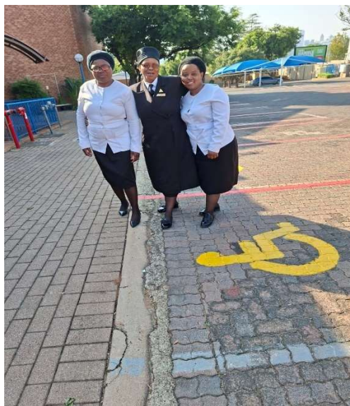
The YWM On-Trials attending their Screening at BMC and conducting a Manyano Service at Lanseria