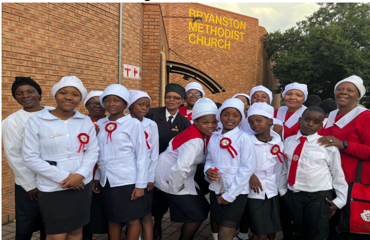
The Newly robed Junior Manyano members with their Co-ordinator and Mothers.